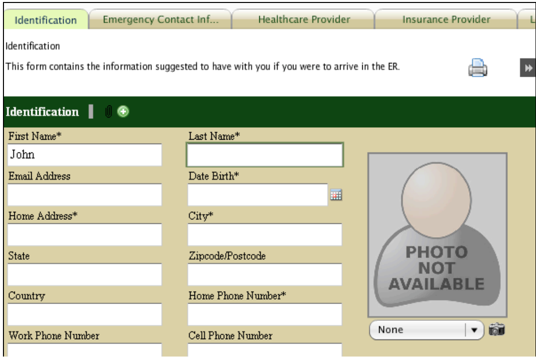
Slide 4 Text Captions: When your ready click on the next tab "Emergency Contact Information" to continue.