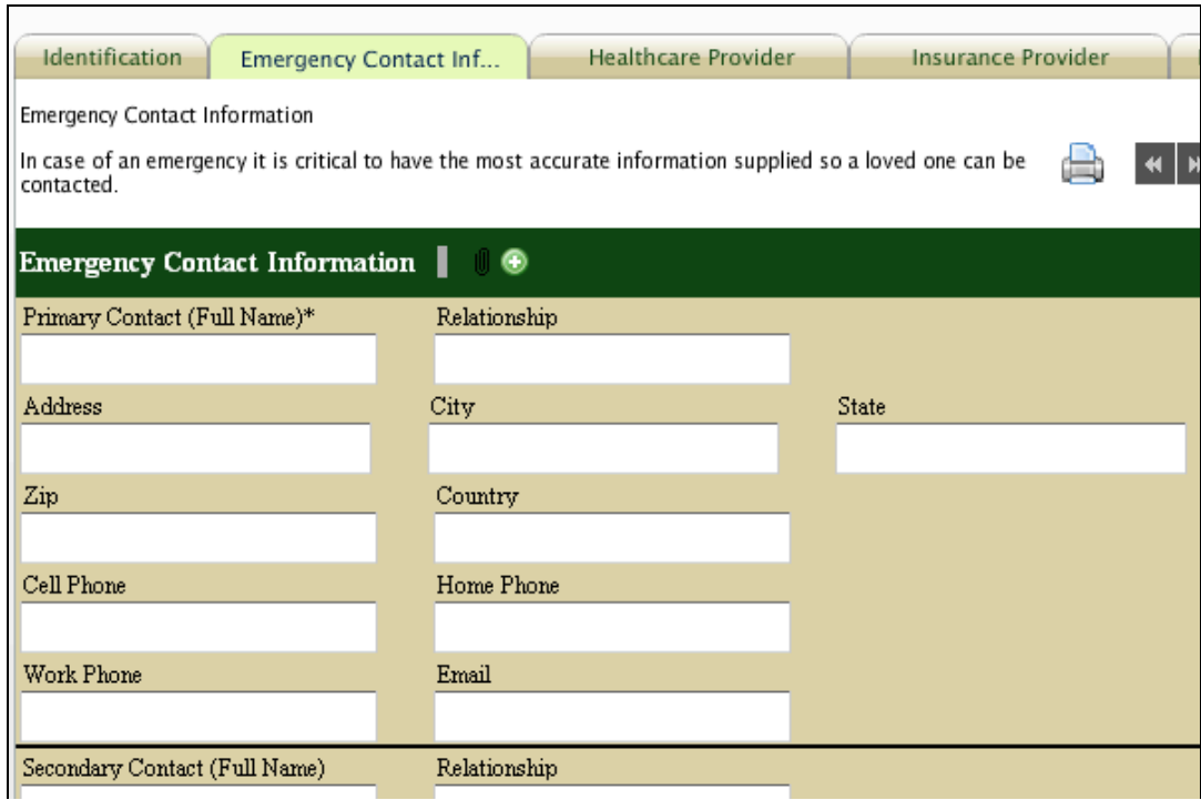
Slide 5 Text Captions: Primary Contact is * also a required field.